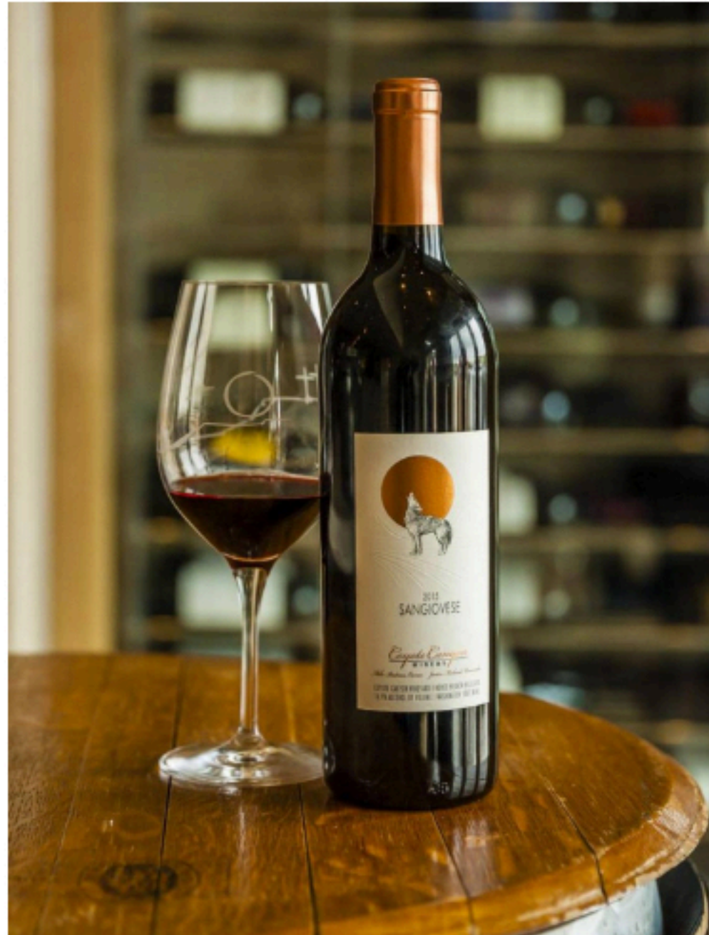
The Coyote Canyon Winery 2015 Coyote Canyon Vineyard Sangiovese from Washington's Horse Heaven Hills won best of show at 2019 Cascadia International Wine Competition in Richland, Wash.